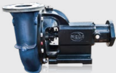
M-4B Standard, CW 306200