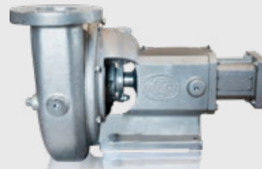
M-4 Complete Stainless Steel, CW 306647

The M-4 series is a clockwise-rotation centrifugal pump with a 6 inch inlet, 4 inch outlet, and maximum speed of 2,400 RPM. Inlet and outlet connections are flanged to provide a solid, leak-proof mount to the tank plumbing. The heavy-duty stress-relieved cast iron frame and volute case provide solid mounting to the tank and more than 1,300 gpm flow (up to 140 psi max).