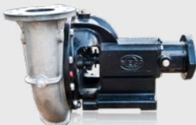
M-4B Corrosion Resistant, CW 306201